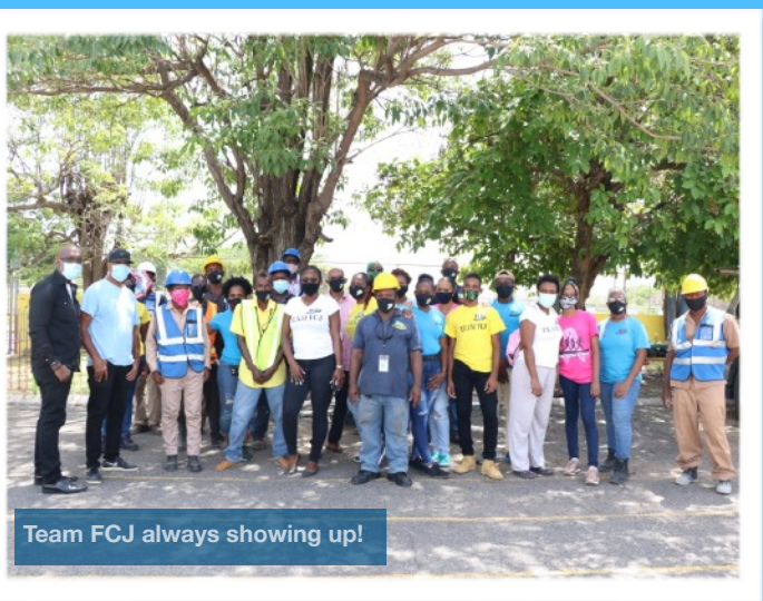
Team FCJ always showing up!