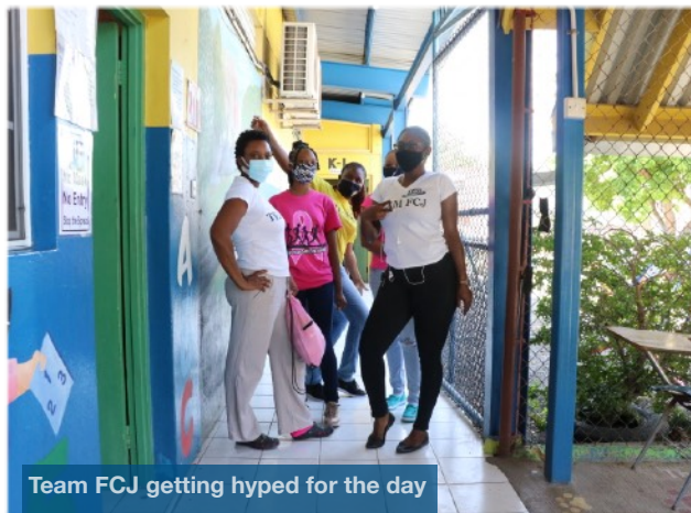
Team FCJ getting hyped for the day

Thank you again to our FCJ Angels who continue to show up and give back.