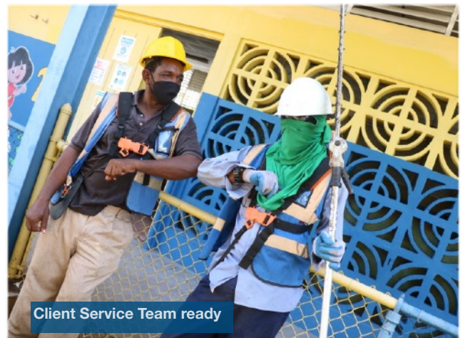
Client Service Team ready