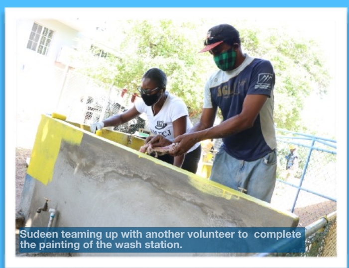
Sudeen teaming up with another volunteer to complete the painting of the wash station.